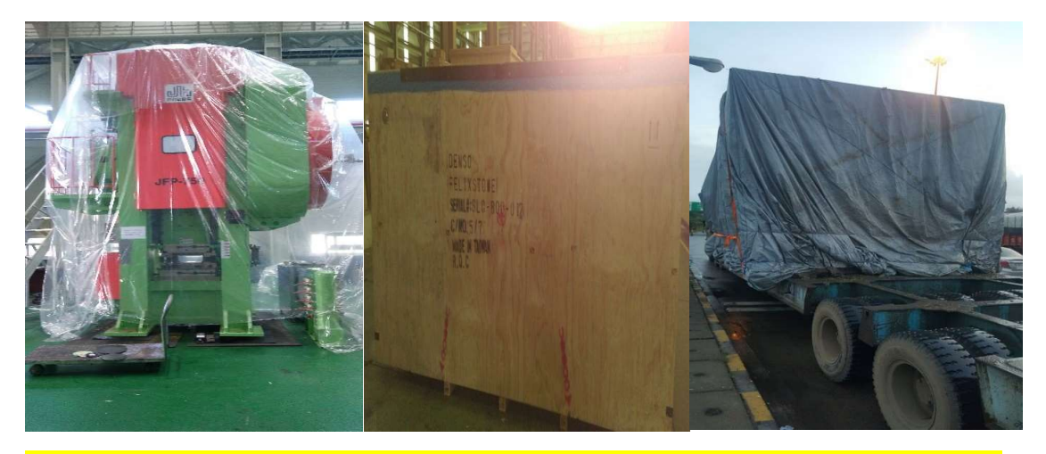
Cargo Description: 105 Ton, 300 and 600 Ton Link Motion Press Machine