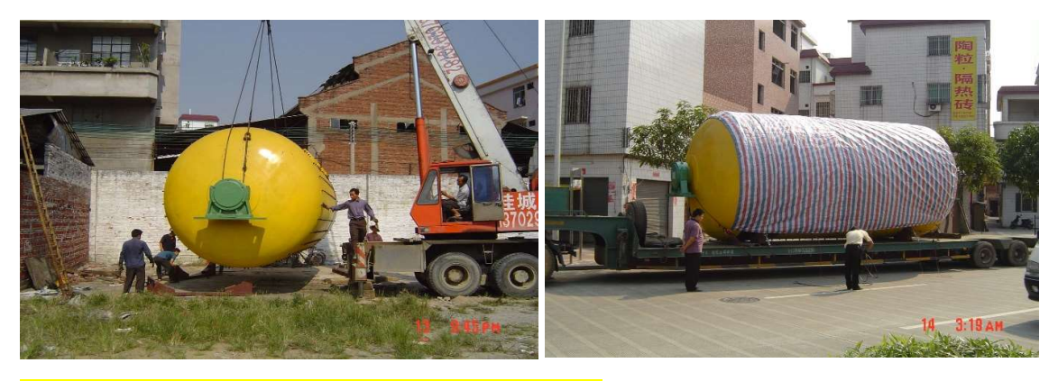
Cargo Description: Ball Mills, China – India