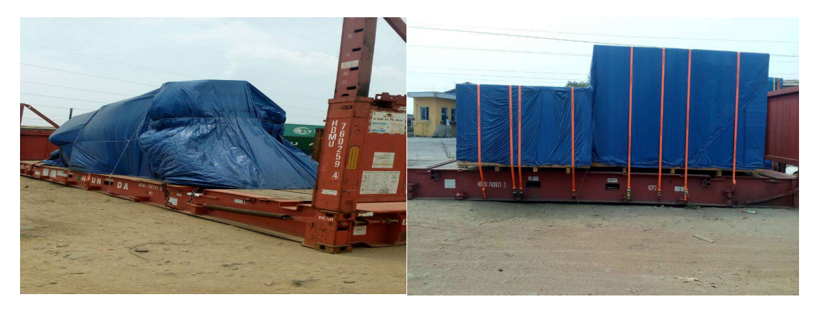
Cargo Description: 750 Ton Hot Forging Press, Korea – India