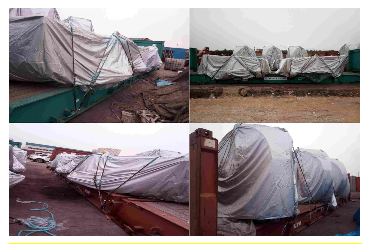
Cargo Description: Windmill Gear Boxes & Hubs, India to Various parts in world and Import from Various parts of world to India