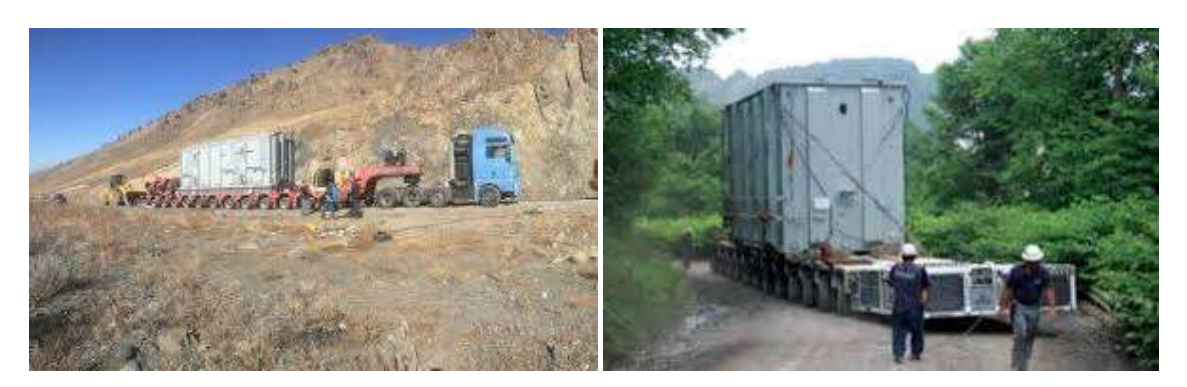
Cargo Description: Transformers, India to Various parts in world