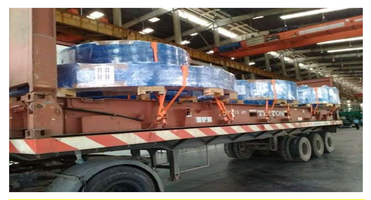
Cargo Description: Windmill Tower Flanges, India to Various parts in world