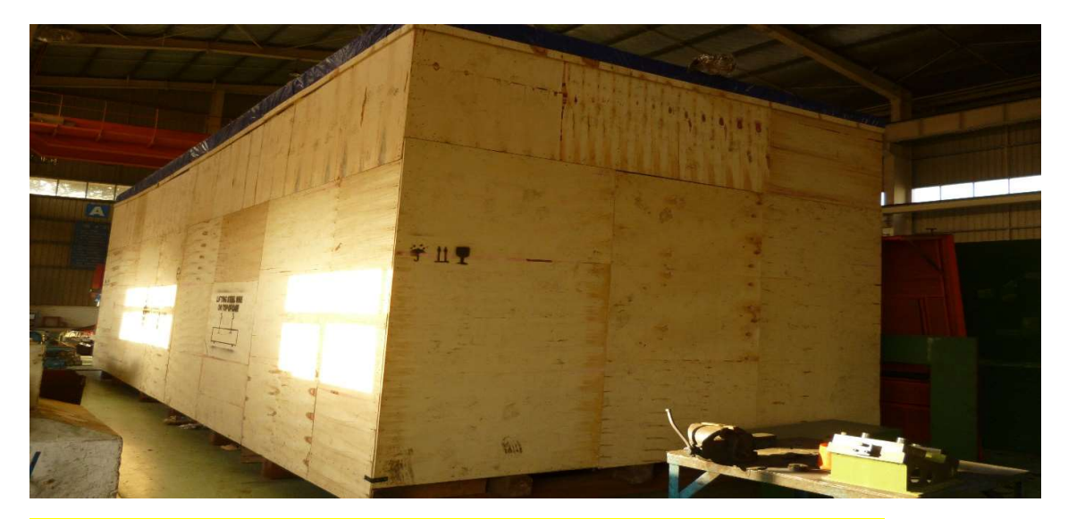
Cargo Description: Bolt Formers, China, Taiwan, Europe – India