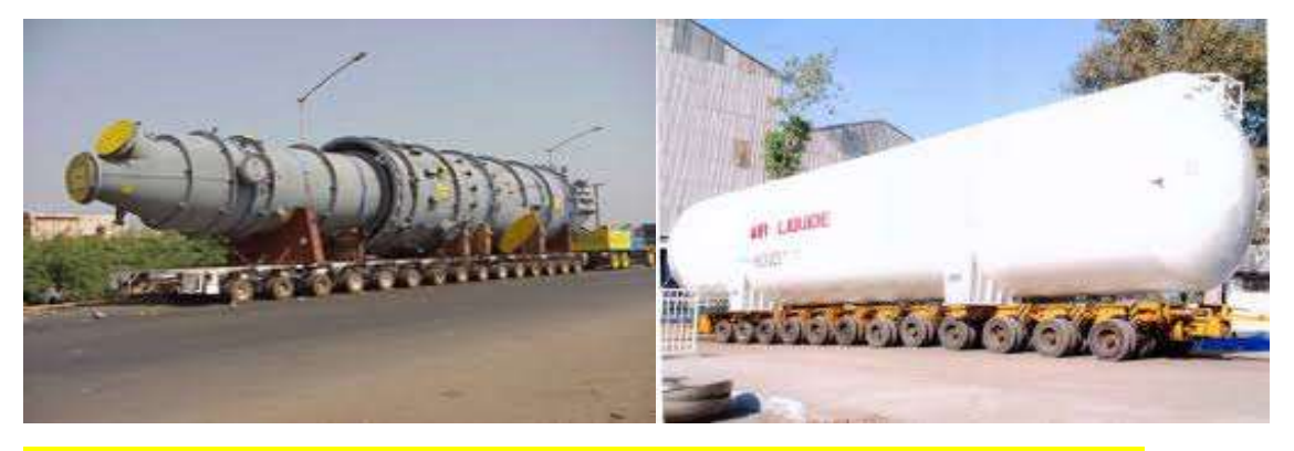
Cargo Description: Pressure Vessels, India to Saudi Armaco Project